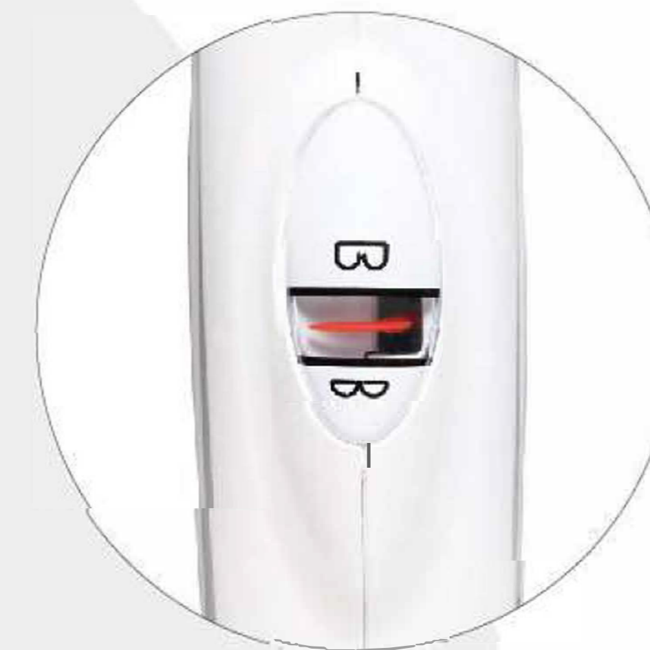
180 degree arched firing indicator window