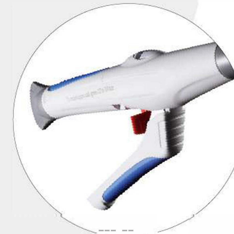
One-handed firing trigger