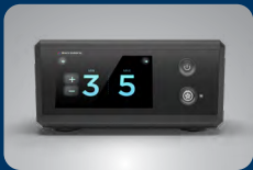
Generator CSUS 8000