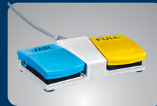
Foot switch FSW2