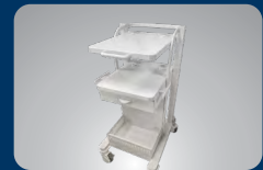
Trolley (Optional) CART 6000