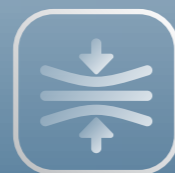
Tissue Sense 2.0 Output Adjustment Precise Thermal Control